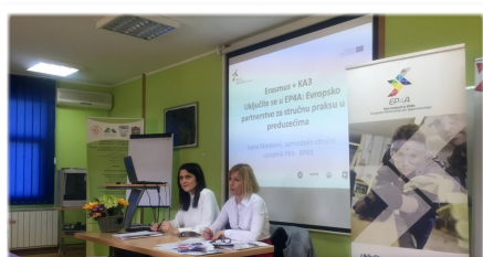
Follow up Workshop Serbia

On 2 April 2018 , the “follow-up” apprenticeship partnership formation workshop for Serbia was organised at the Regional Centre for Professional Development of Education Workers in Čačak. The representatives of City of Čačak, companies and vocational schools from Čačak and representatives from the Chamber of Commerce and Industry Serbia – Regional Chamber of Commerce and Industry for Moravice and Raška Administrative Districts participated in the workshop. After the presentation of EP4A project activities, Memorandum of Understanding points were discussed. Once again, the importance of communication between all stakeholders was emphasized as the key to establish quality practical training. The Memorandum will be signed at the end of April 2018, at a round table in Čačak.