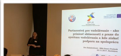
Apprenticeship Partnership Workshop Slovakia

● Vocational education and training Act in Croatia amended (March 2018)